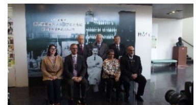
Visit of Hideyo Noguchi Memorial Museum