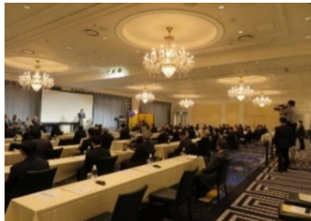
Welcome ceremony hosted by Cabinet Office