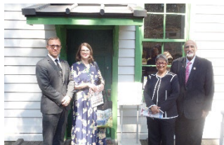
Nagahama Hall (Bacterial Laboratory)