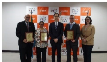
Courtesy Call to Governor of Fukushima and International Exchange Special Ambassador Certificate Ceremony