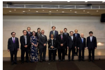
Lecture session organized by Nippon Medical School