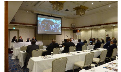
Lecture and Dialogue event organized by the African Society of Japan