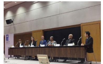
Symposium co-organized by JICA, UNDP and Cabinet Office