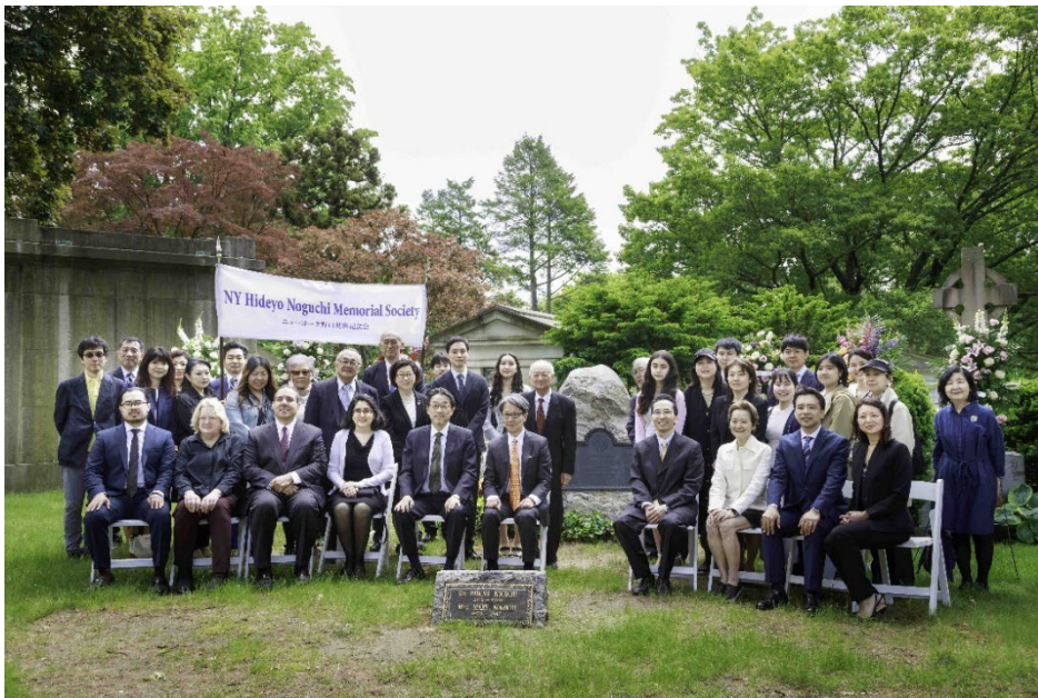
“Graveside service for the 96th Dr. Hideyo Noguchi Memorial Day Graveside Service”