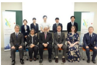
Visit of the YCU and dialogue with the professors