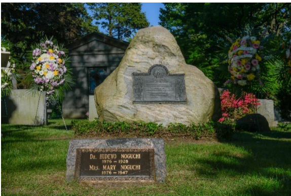
(Gravestone of Dr. Hideyo Noguchi)