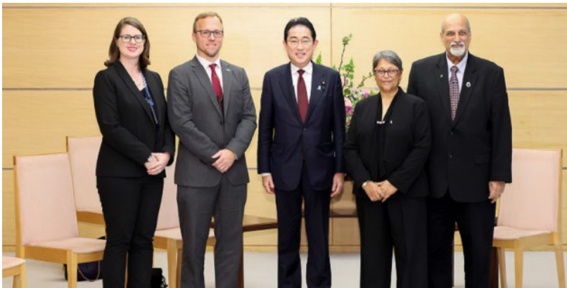
Courtesy Call to Prime Minister Kishida (Source : Website of the Prime Minister's Office of Japan ) https://japan.kantei.go.jp/101_kishida/actions/202303/_00015.html

The invitation program for the laureates took place from 13th to 17th March 2023.